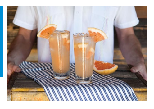
craving bright, fresh, cali-mex inspired dishes? keep it local.